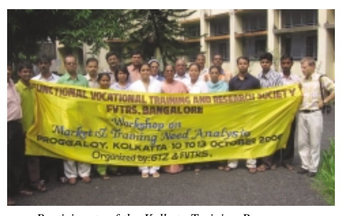
Participants of the Kolkata Training Programme

FVTRS conducted two training programmes on, 'Market and Training Needs Analysis', the first one at Kolkata from 10 to 13 October and the second at Patna from 5 to 8 December 2006. These workshops were conducted as part of the strategic partnership with GTZ/NVTS for building capacities of partners in the ongoing projects and for prospective partners. The core content of these workshops dealt making proper analysis of needs, identifying opportunities and challenges and understanding the target group for designing effective training interventions in partnership with them for the desired impact.